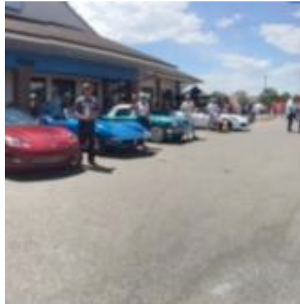
ALL FOUR WINNERS